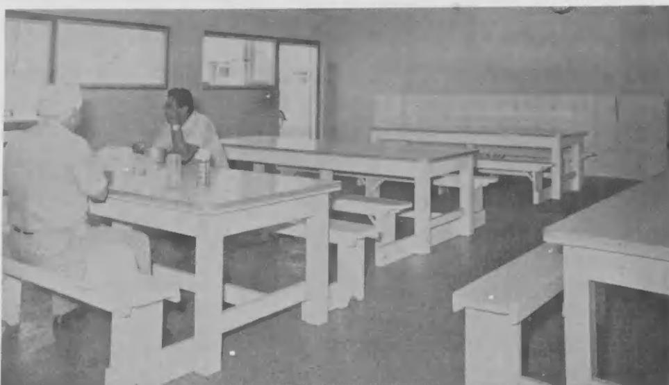
These men are enjoying their lunch at one of the six white formica-covered tables in the Finger Pier Lunch Shelter. In the background, near one of the entrances, a row of lockers can be seen.

E empleadonan aki ta disfrutando di nan cuminda sintá na un di e diez mesanan blanco cubri cu formica na Finger Pier Lunch Shelter. Parti patras, cerca di uno di e entradanan e lockernan pa warda cuminda por ser mirá.